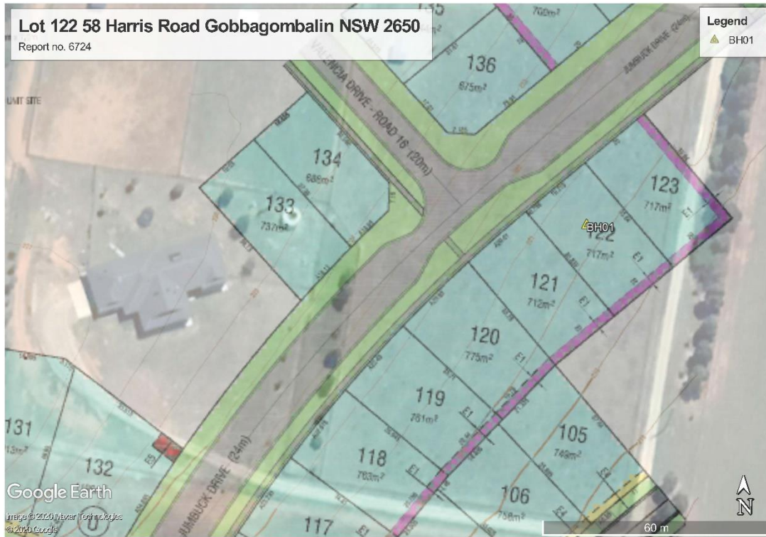
Figure 1: Annotated site plan overlain on aerial photograph depicting borehole locations